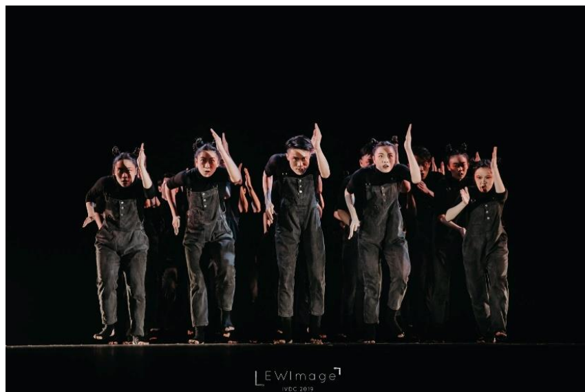
Dancers are so focused