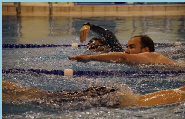
Swimming laps and laps!