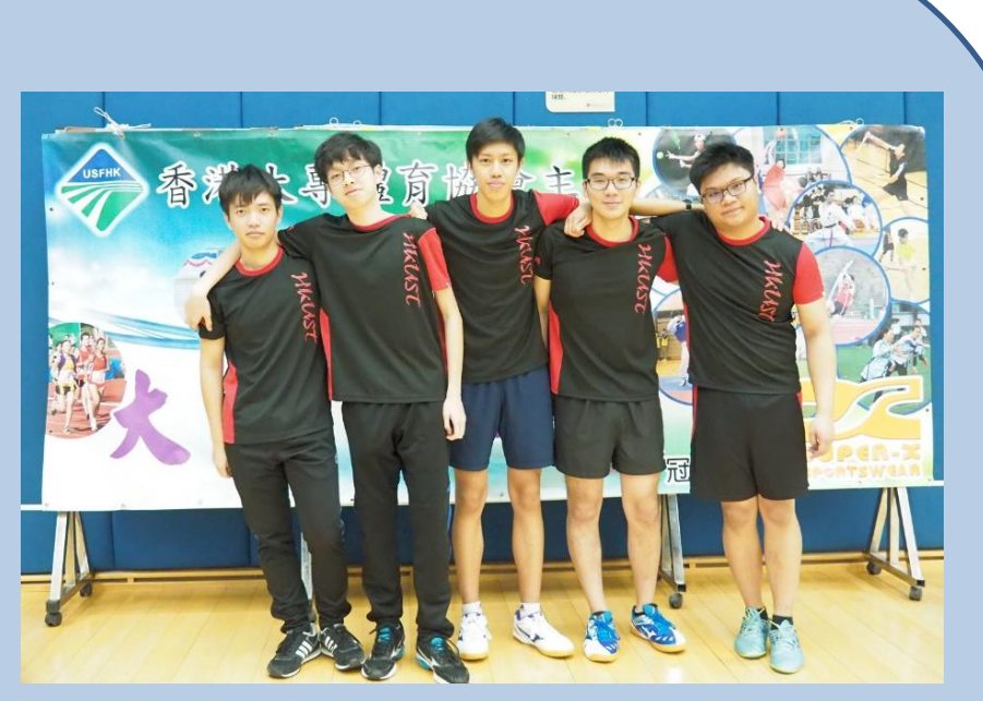
A group photo of Men's Table Tennis Team after the final match at the USFHK competition.