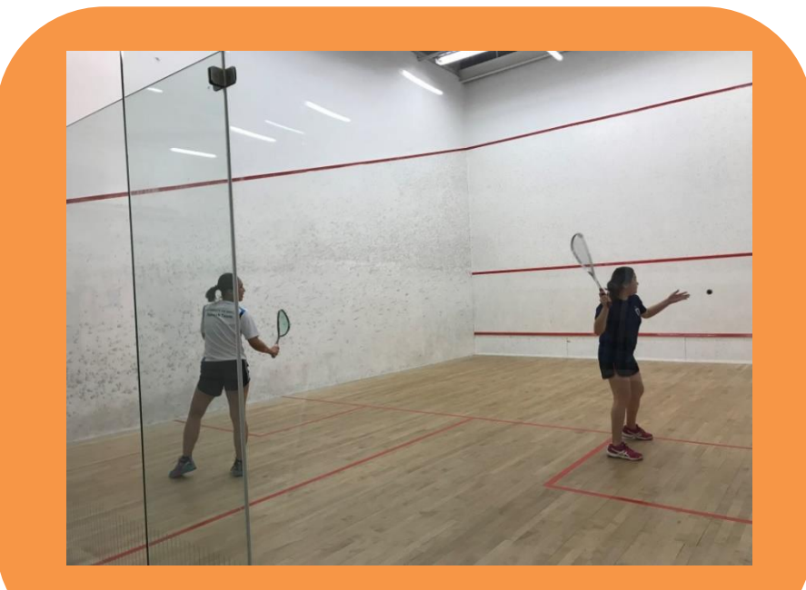
Women's team in final on 24 Feb., 2019.

The HKUST Squash Teams demonstrated outstanding performance in the 2018-19 USFHK Squash Competition. Our men's & women's teams went through intense training sessions every Tuesday and Thursday night with increased attendance rates compared to the past few years. In addition to the regular practice on campus, they also had extra training activities off campus to get every team member better prepared for the inter-varsity competition. The team had also fostered closer bondage this year by having dinner together after every training session and by studying techniques used by professional players to improve ourselves.