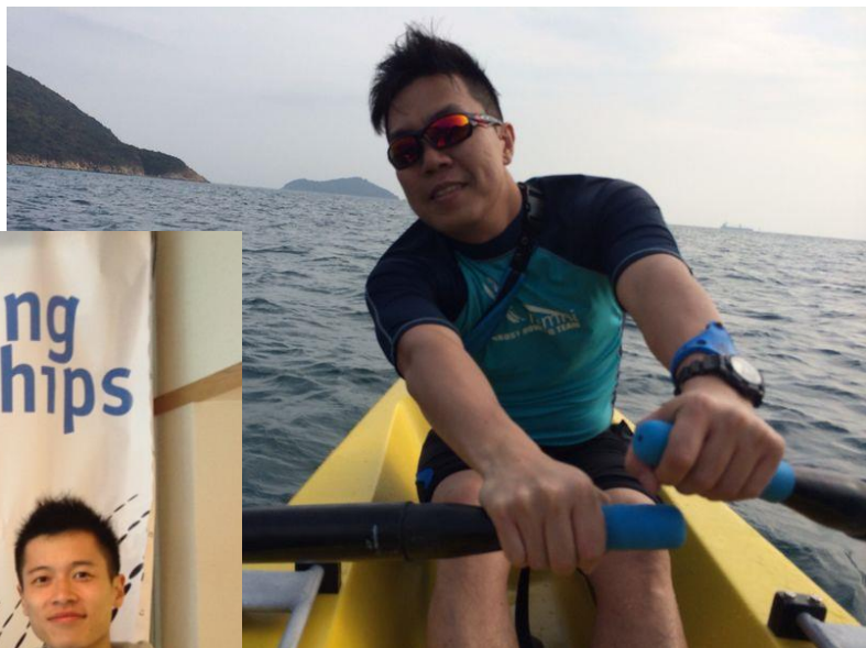
The hand position for coastal rowing is higher than for flat-water rowing.