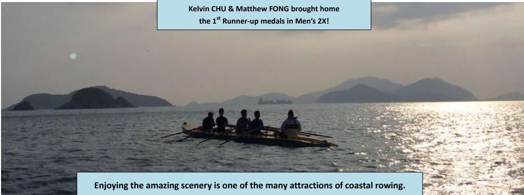
Enjoying the amazing scenery is one of the many attractions of coastal rowing.