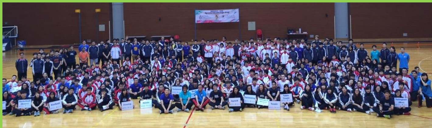
Happy faces of the HKUST and UM Sports Family of about 500 students and staff.

About 230 HKUST student athletes, coaches and staff participated in the 16 th HKUST-UM Sports Challenge Cup at the University of Macau on Saturday, 25 April 2015. HKUST athletes won the Korfball, Squash and Tennis events, tie in Fencing and lost in 11 events. HKUST Teams enjoyed the contests and the hospitality of the host. They also admired the spacious new campus and sport facilities in UM.